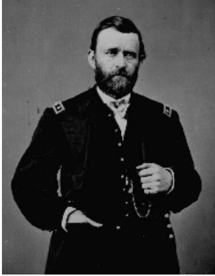
Lieut. Gen. Ulysses S. Grant, U.S.A.